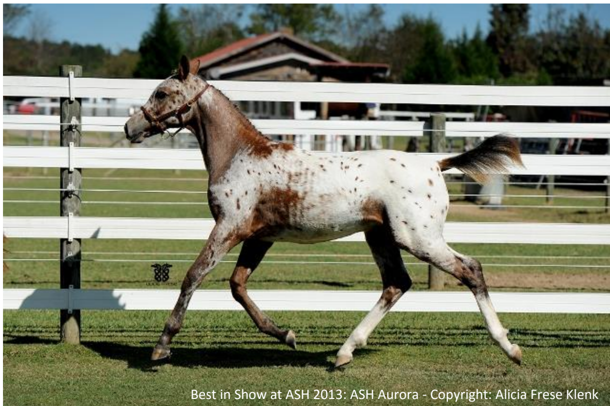
Best in Show at ASH 2013: ASH Aurora