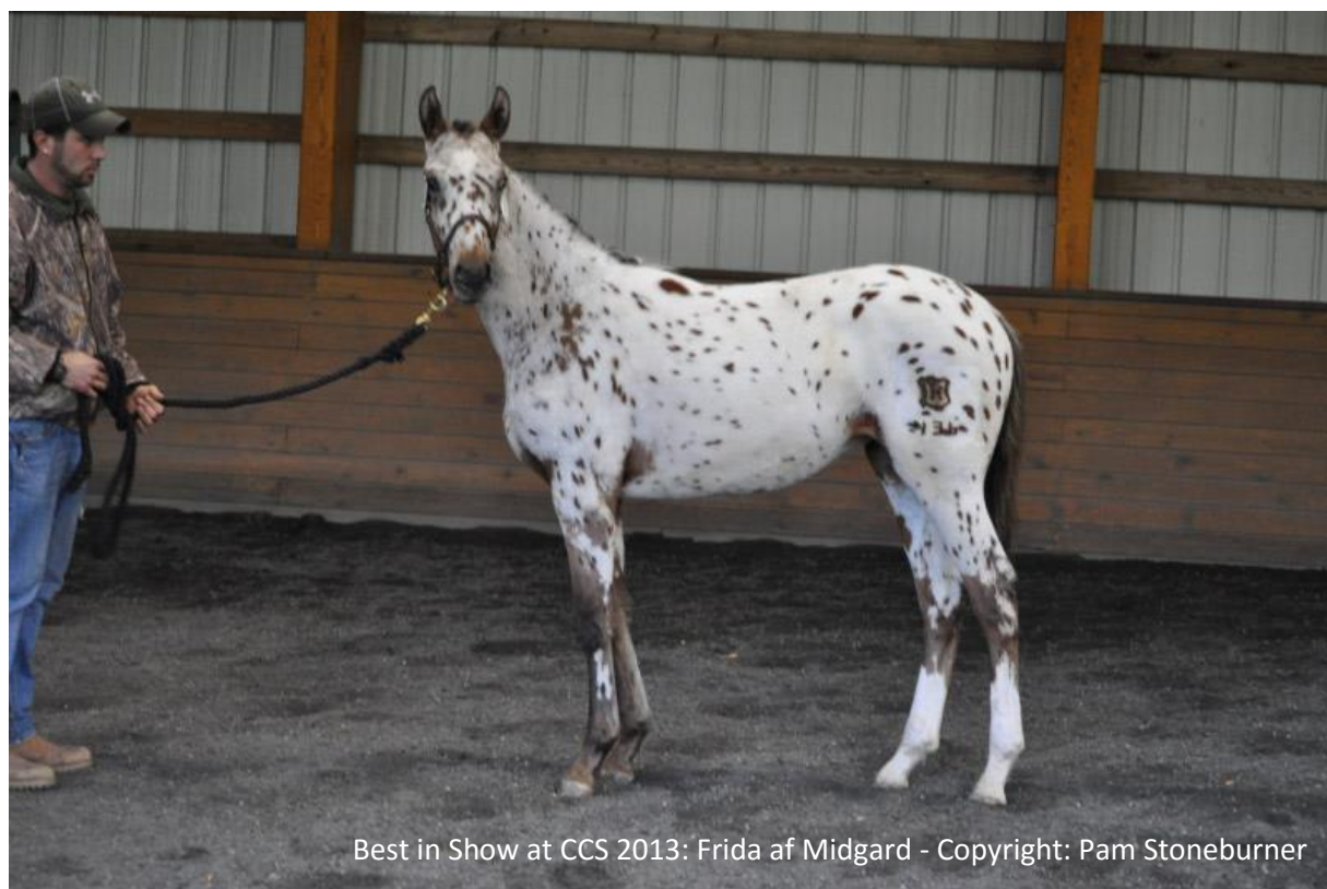
Best in Show at CCS 2013: Frida af Midgard

Best of Luck with your Knabstruppers in 2015!